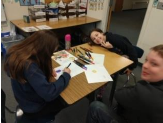
6 th grade students working on Bucketfiller projects.